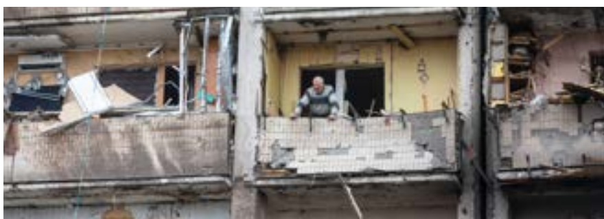
Kyiv, Ukraine

OVER 30,000 CASUALTIES AND 1.5 MILLION HOMES DESTROYED SINCE THE OUTBREAK OF WAR IN UKRAINE