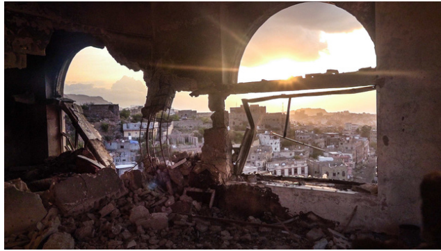
@Taiz, Yemen

“a partial or total encirclement of enemy forces in a village, town, or city for military advantage in an armed conflict, whether with a view to inducing the surrender of the besieged forces or to impeding their effective contribution to military action”