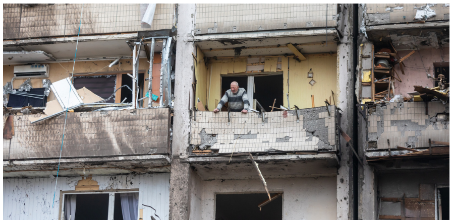
Kyiv, Ukraine

Ceasefire remains steadfast in its commitment to addressing the urgent need for reparations in Ukraine. By advocating for a comprehensive and victim-centred approach, we aim to bring justice, healing, and a path to rebuilding for the civilians affected by the ongoing conflict.